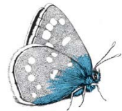
THE XERCES SOCIETY POLLINATOR CONSERVATION PROGRAM